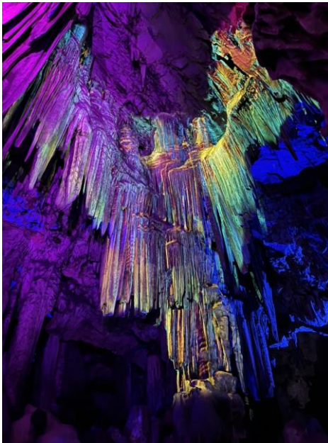
Saint Michael's Cave, Gibraltar

The Feast of Saint Michael and All Angels