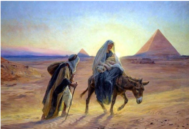
The flight into Egypt