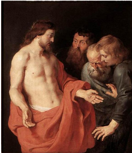
The Incredulity of Saint Thomas, 1613 by Peter Paul Rubens 1577-1640